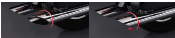
Peacemaker end caps can be easily rotated to suit your style preferences.

When the Diverter Valves are opened, the exhaust gases flow through the straight pipe down the center of the muffler, resulting in increased exhaust sound volume and greater engine performance.